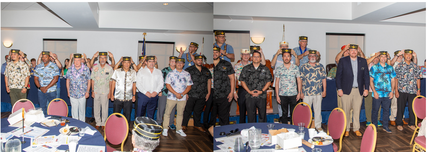
(L to R) Members from the Spring Reunion were capped that evening.